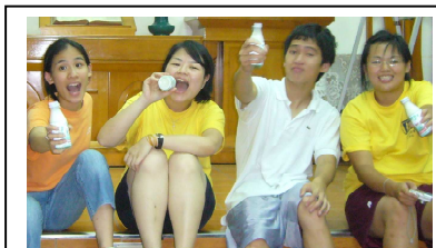
My teammates and I in Xiushui, 2008